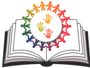
Writing the Next Chapter Together

"You are the light of the world. A city that is set on a hill cannot be hidden. Nor do they light a lamp and put it under a basket, but on a lampstand, and it gives light to all who are in the house. Let your light so shine before men, that they may see your good works and glorify your Father in heaven." —Matthew 5:14-16